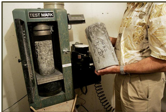
Material Testing /QC